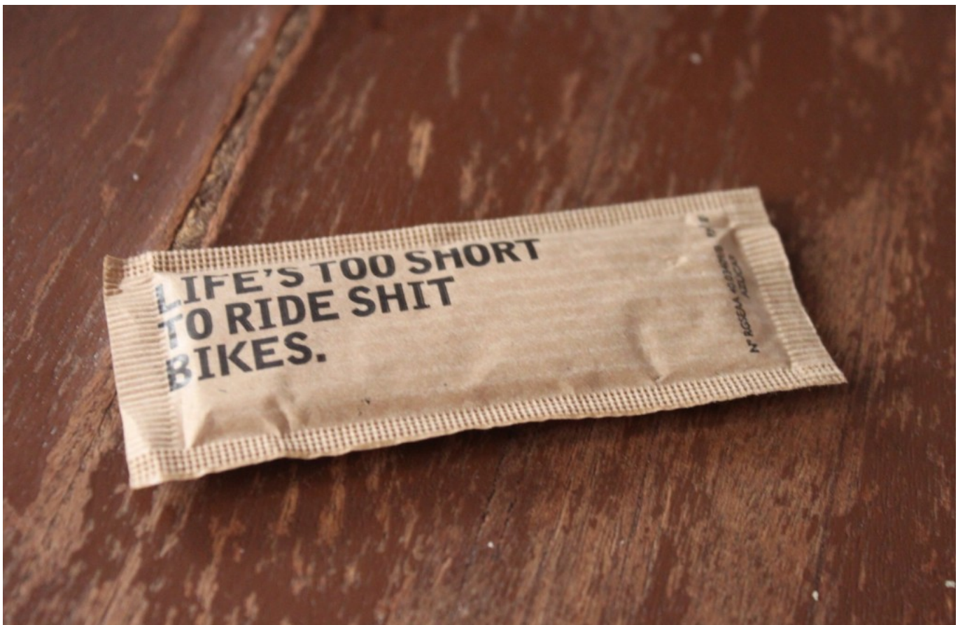
Coffee drinks come in all shapes and sizes. The standards are