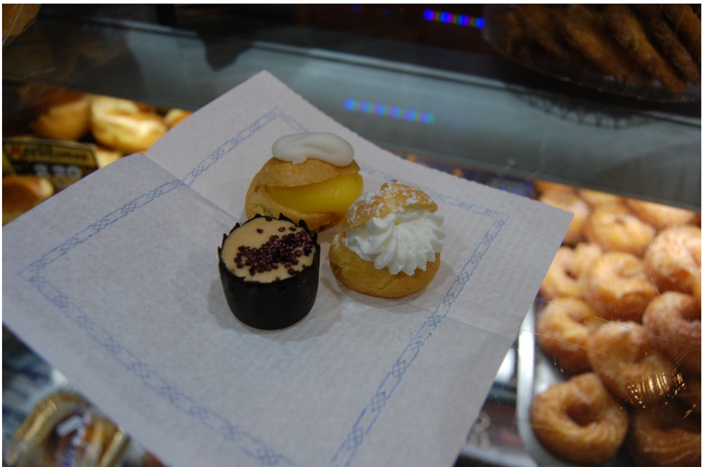
Each tray is slightly different, with six rows of beautifully