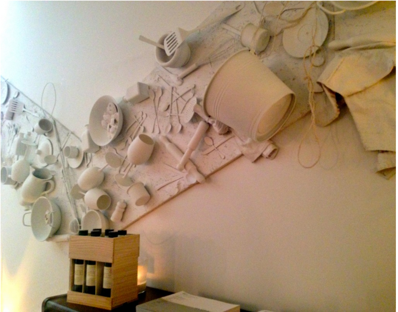
The decor is also original, elegant and minimalist.