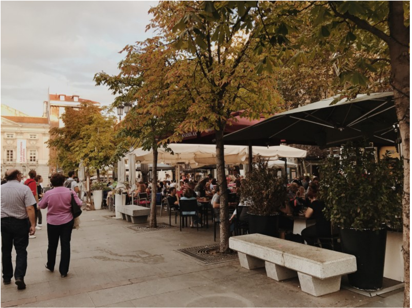
Plaza Santa Ana

Now I don't spend too much time around that neck of the woods these days, but back then I was literally intoxicated by that square. The beautiful balconies, the long sunny days (I arrived in August) and I even found charm in the guys who play the accordion and then hustle for your change. The large majority of those afternoons were spent on the terraza of restaurante Lateral .