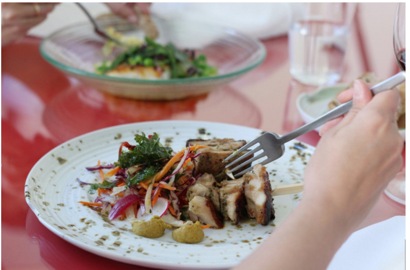
Somos is the most recent offering from Grupo Le Cocó and with