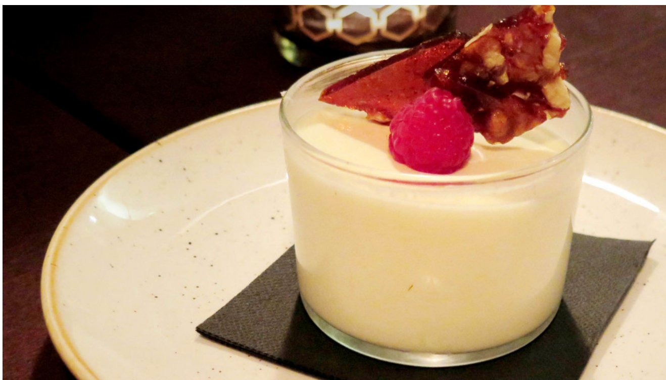
The Amaretto Connection

Despite being pretty full, we ordered the Margherita Cheesecake and the Amaretto Connection for all of us to share, because when a dessert is good enough (and you know what I'm talking about here), you'll find room for it.