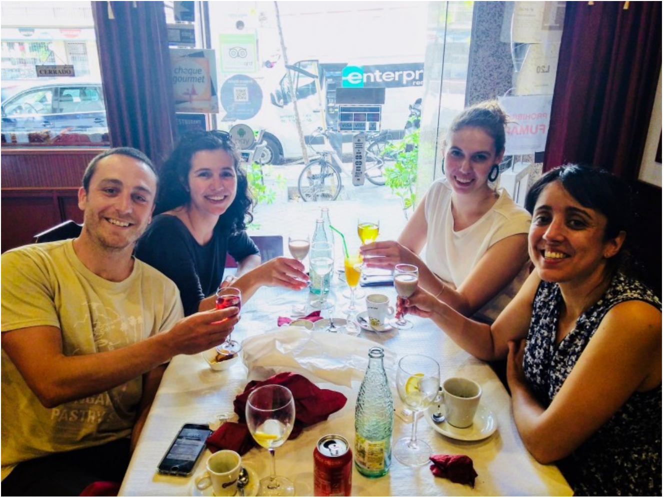
The management team at Atocha Tandoori!