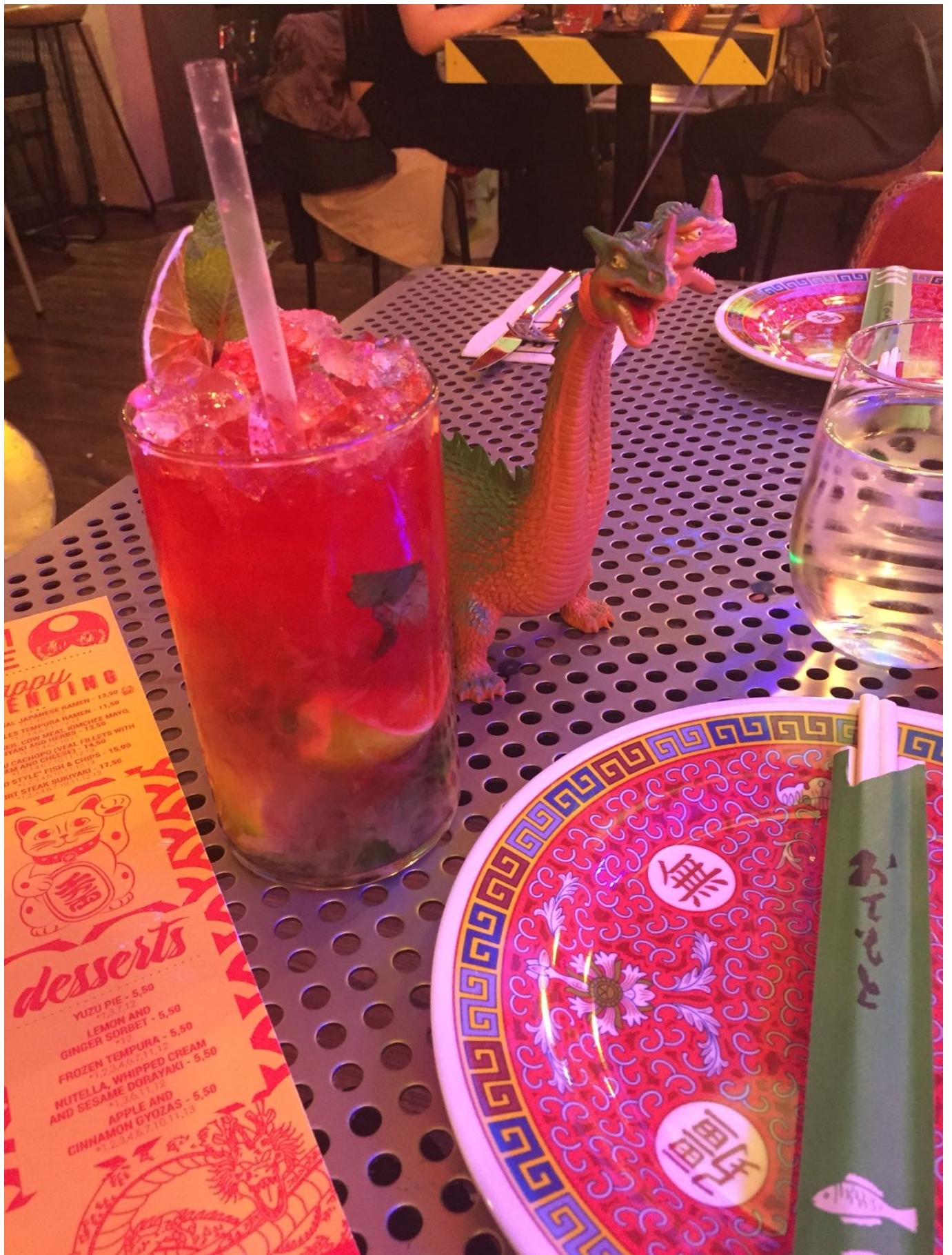
Our aperitivo came complete with a flaming dragon (I was told that I needed to squeeze his tummy three times for good luck)