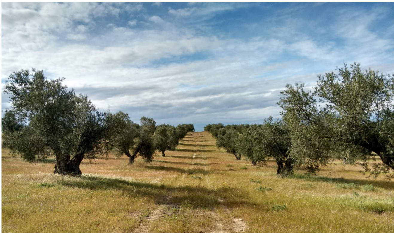
The centenarian olive trees

gnarled and twisted, with silver miniature leaves and shiny hard fruit, ready for the annual harvest of some of the tastiest organic extra virgin olive oil in Spain.