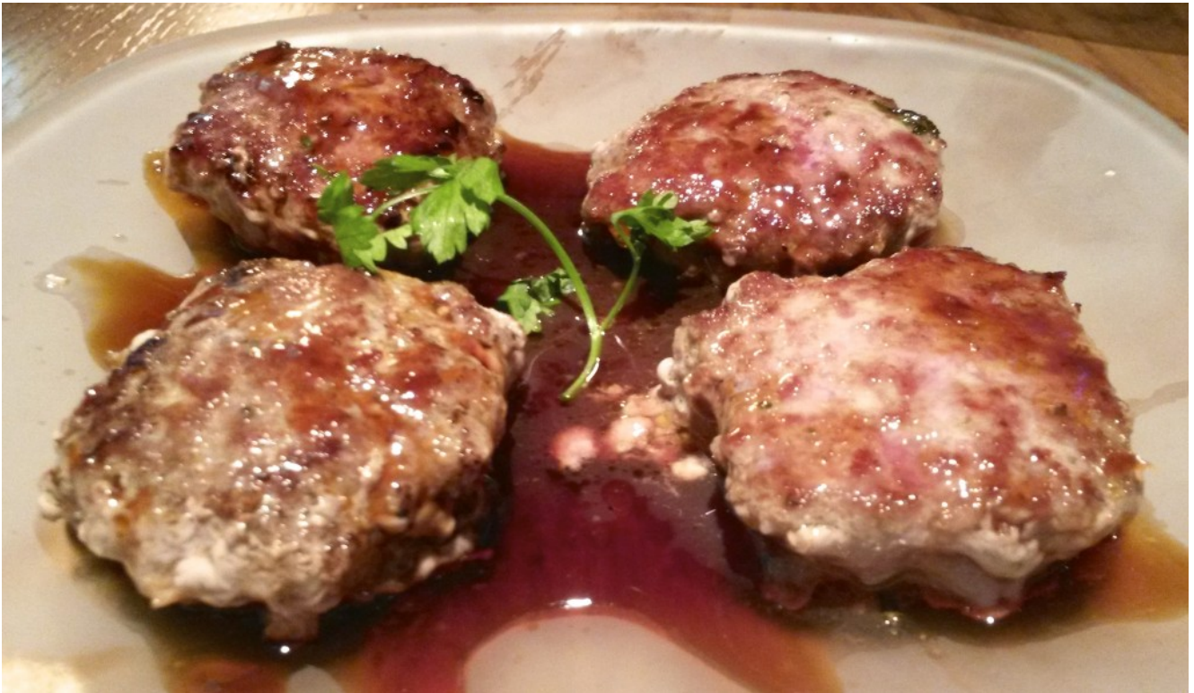
mini hamburguesas con reducción de Pedro Ximenez (sherry reduction)

Although the Spanish passion for croquettes is not always understood by foreigners, las croquetas de jamón are a must here too, as are the albóndigas (meatballs). Since I always order them both, last week I decided to venture out a bit and went for the mini-hamburgers instead, and wow, that was a good choice. They're served with a reduced Pedro Ximenez (sherry) sauce which you can sop up with bread.