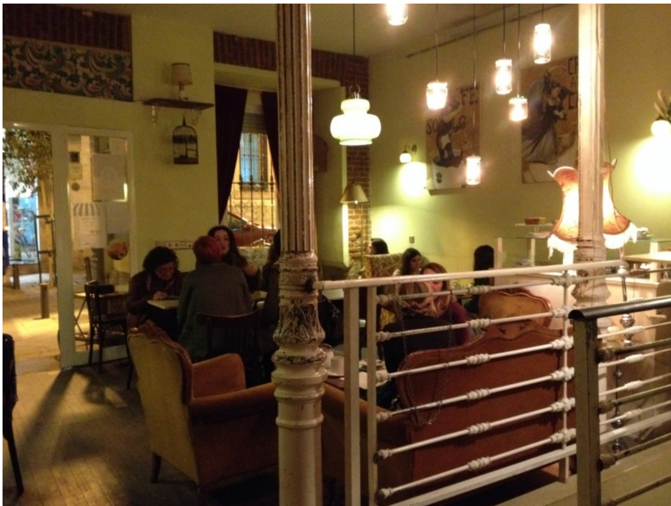
funky furniture at La Paca

of Spain fills the room: old sofas, lamps, Galician mirrors, and bird-cages. La Paca 's owner is an antique collector who travels across Spain in pursuit of treasure troves. You can find his finest pieces either sold at his vintage store La Republicana , or displayed at La Paca.