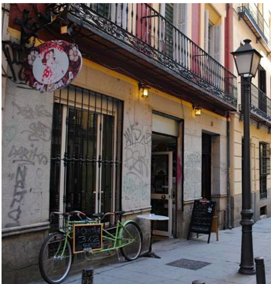
La Paca's facade on calle Valverde in Malasaña

As you walk through La Paca 's door, you feel like you're in the right place. This funky café in Malasaña is always a good choice when you're in the mood for a coffee, a beer, or something stronger.