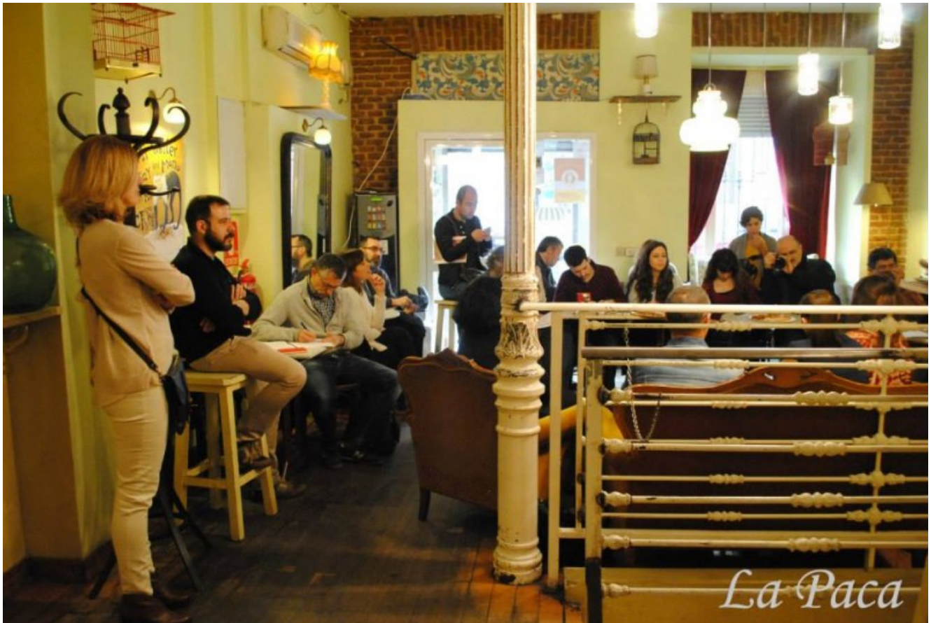
Theater performance at La Paca