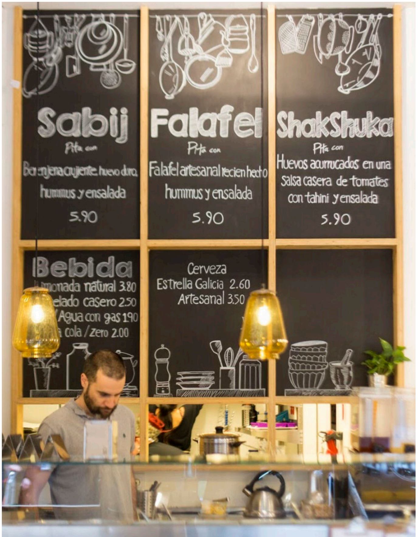
There are three options to choose from. Each one is to be the contents of a delicious, home-baked pita. However, the main character of this tale has to be the falafel. I would love to