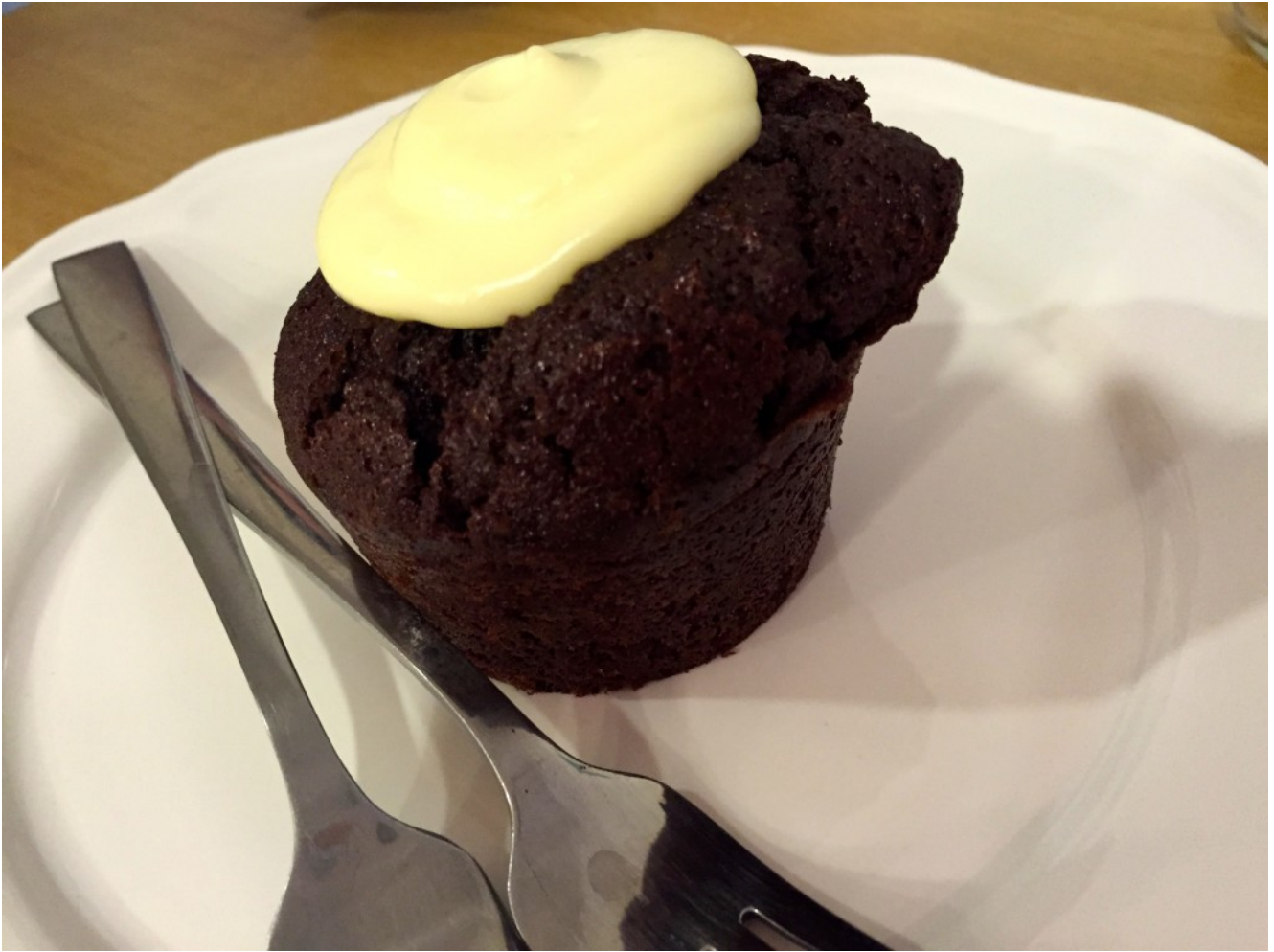
Guinness Chocolate cake

All this feast of food could only be accompanied by a typical Iranian drink, infused with cucumber, flowers and other refreshing ingredients. How can you describe something that tastes so good? They now have two different drinks based on this one: One is call Tejebin: The same drink but with tea and Cafejebin: The same but with coffee.