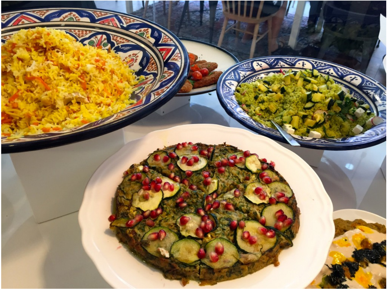
Food on display