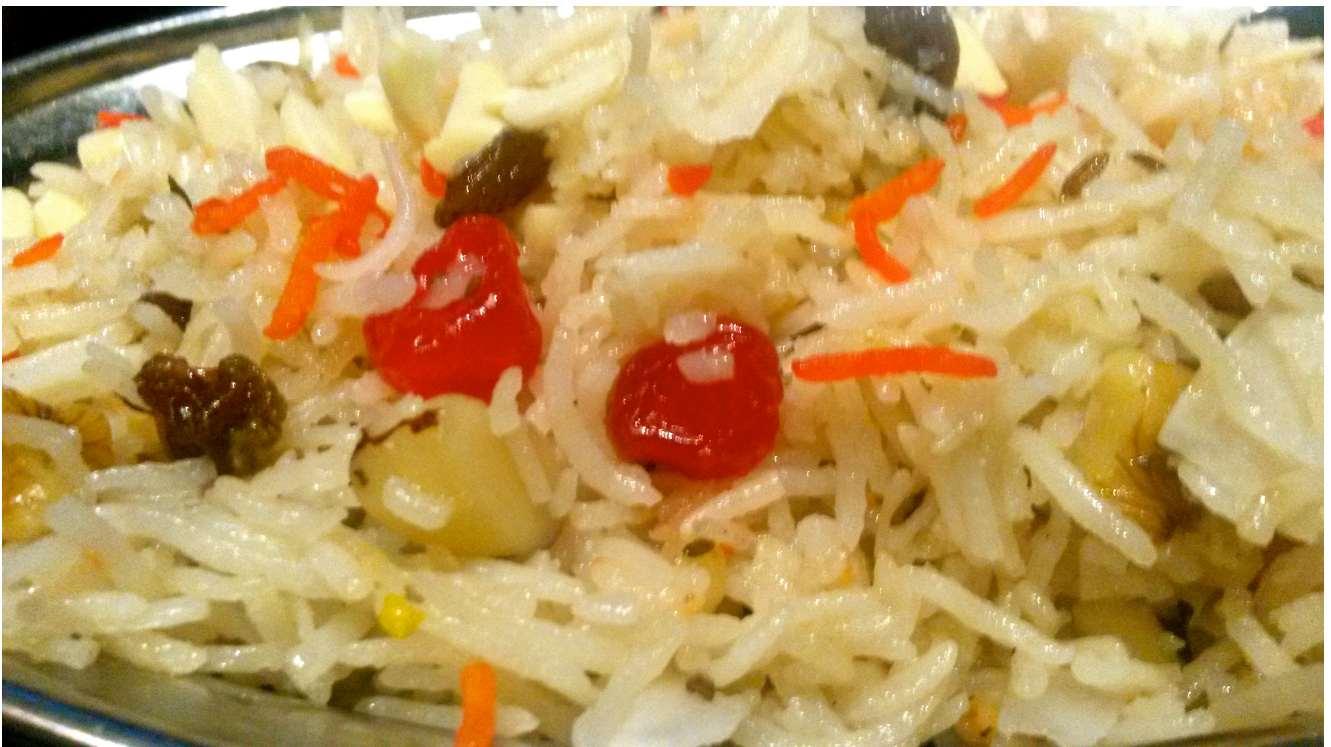
Kashmir Ka Pulao rice