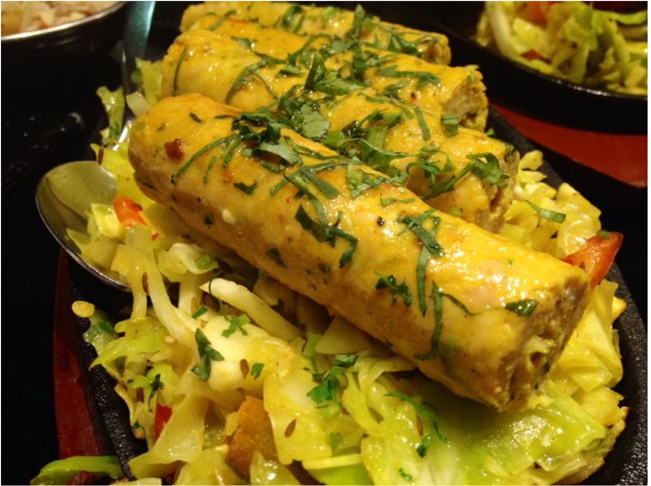
Murghi Ki Balti chicken curry

We shared several other dishes too. Our table was full of colours and smells, and it took some creativity as to what sauce and rice to mix with what chicken or vegetable. We had Murgh Ka Tikka (marinated tandoori chicken) which I liked even more than the Murghi Ki Balti .