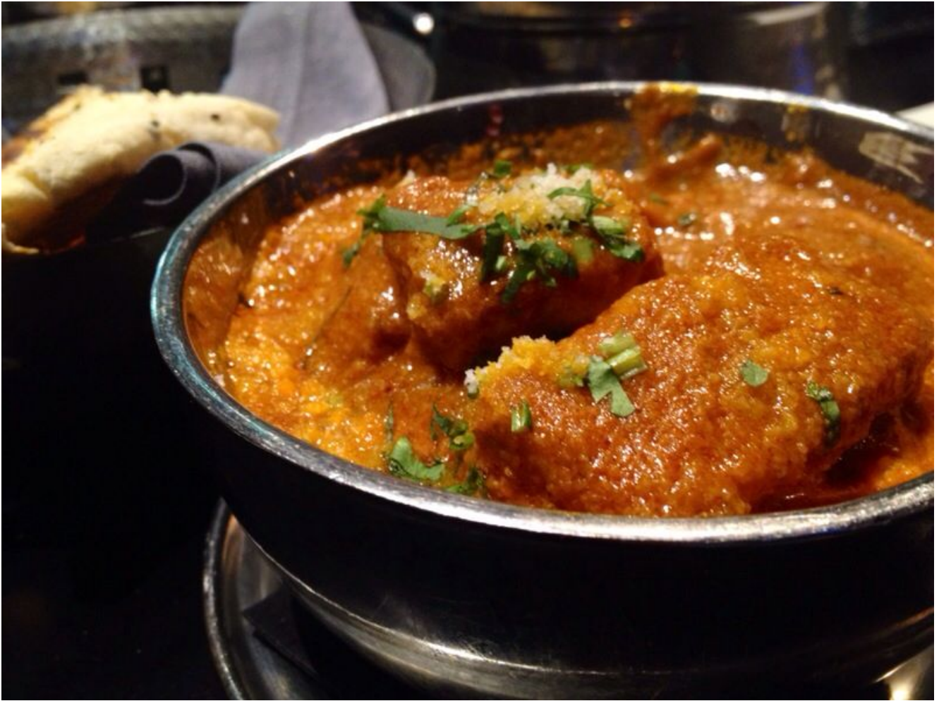
Madras Wali Machli swordfish