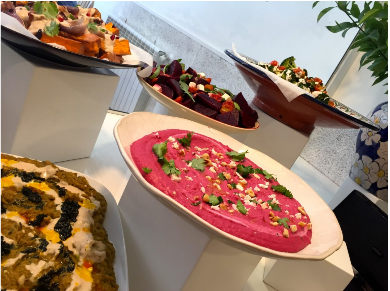
Food on display

for me, each dish at Banibanoo tastes unique and exotic, for the mixture of flavors and variety of ingredients on each plate.