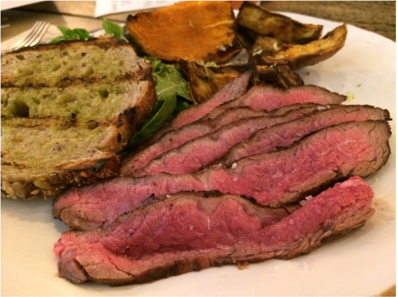
A market plate with ternera madrileña and roasted sweet potatoes