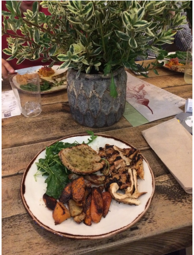
Chipotle chicken and seasonal vegetables

Is your mouth watering yet? I've barely gotten started. After you choose your base, you get to add extra sides from an overwhelming list. Cold options include coleslaw, beet salad, creamed eggplant, lentils, hummus, and roasted watermelon (yeah, you read that right). Hot sides include mashed pumpkin, baked cauliflower, roasted beets, herbed potatoes, seasonal vegetables, and organic sweet potato, each with creative garnishes ranging from spirulina to spiced yogurt.