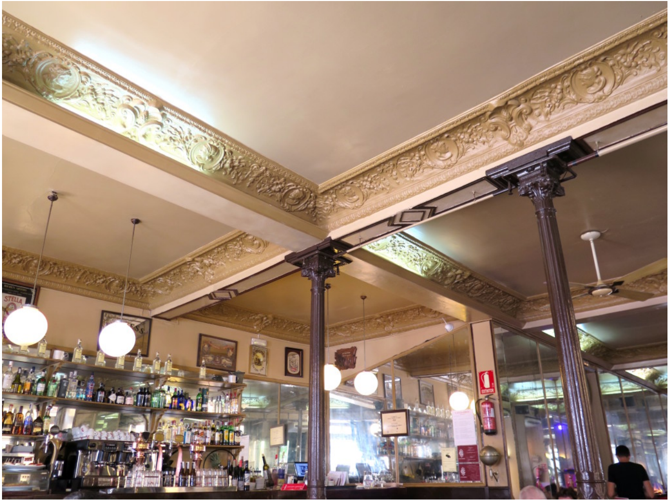
Café Barbieri's beautiful ornate ceiling