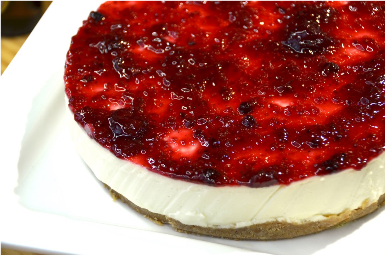
Strawberry cheesecake (wow)

You can also buy a selection of Portuguese beers and wines (including vinho verde ), plus an almond liqueur ( licor de amêndoa ) specially driven over from Portugal by the guy on the right. I bought their last bottle a couple of weeks ago and with it came this story – suddenly €12 seemed like an absolute steal. You'll be glad to know that they've since been back to Portugal and brought another few bottles for us, but get it while you can – or I will!