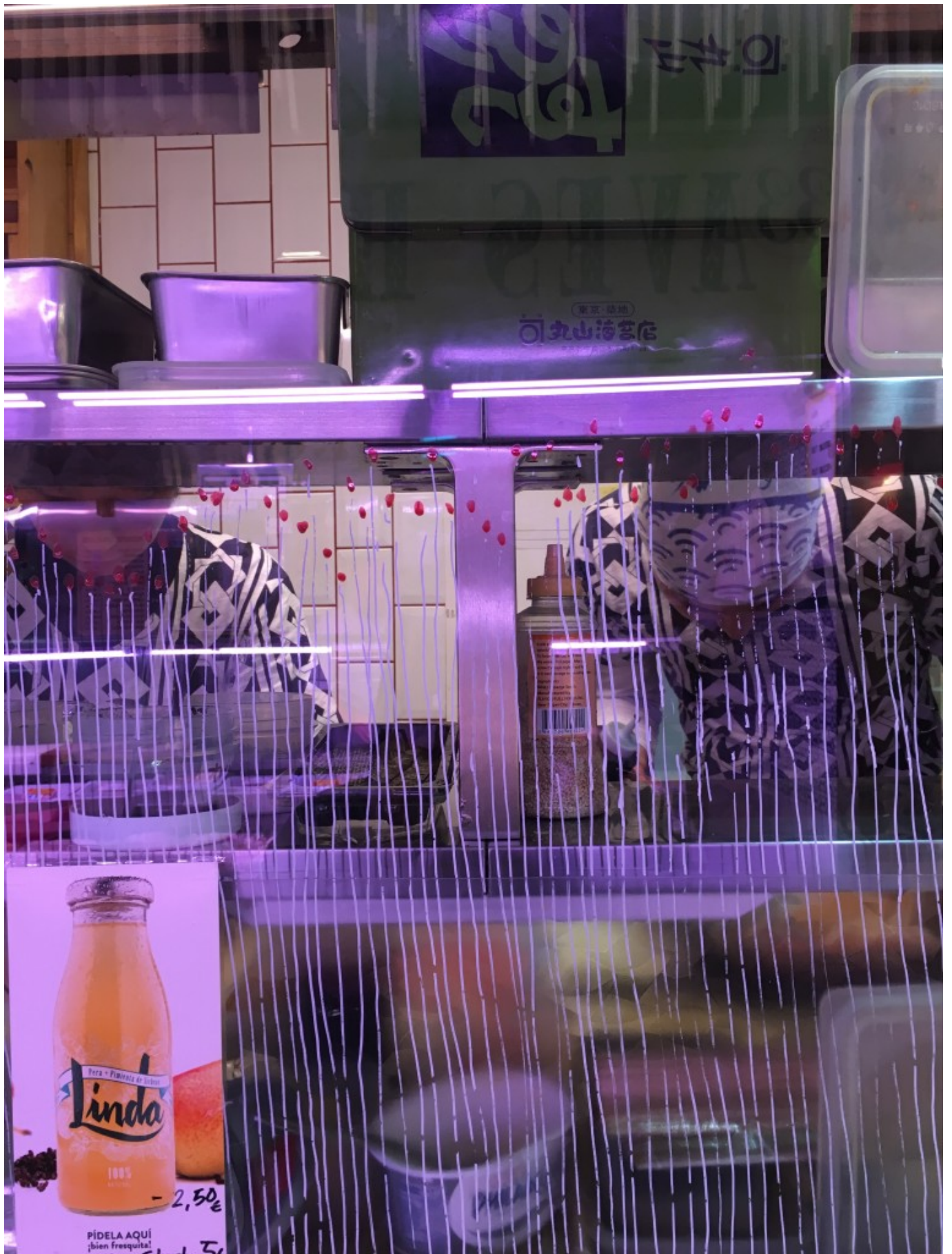
Prices aren't outrageous. For example, eleven euros will buy you the Yoka Loka sampler box with between nine and thirteen