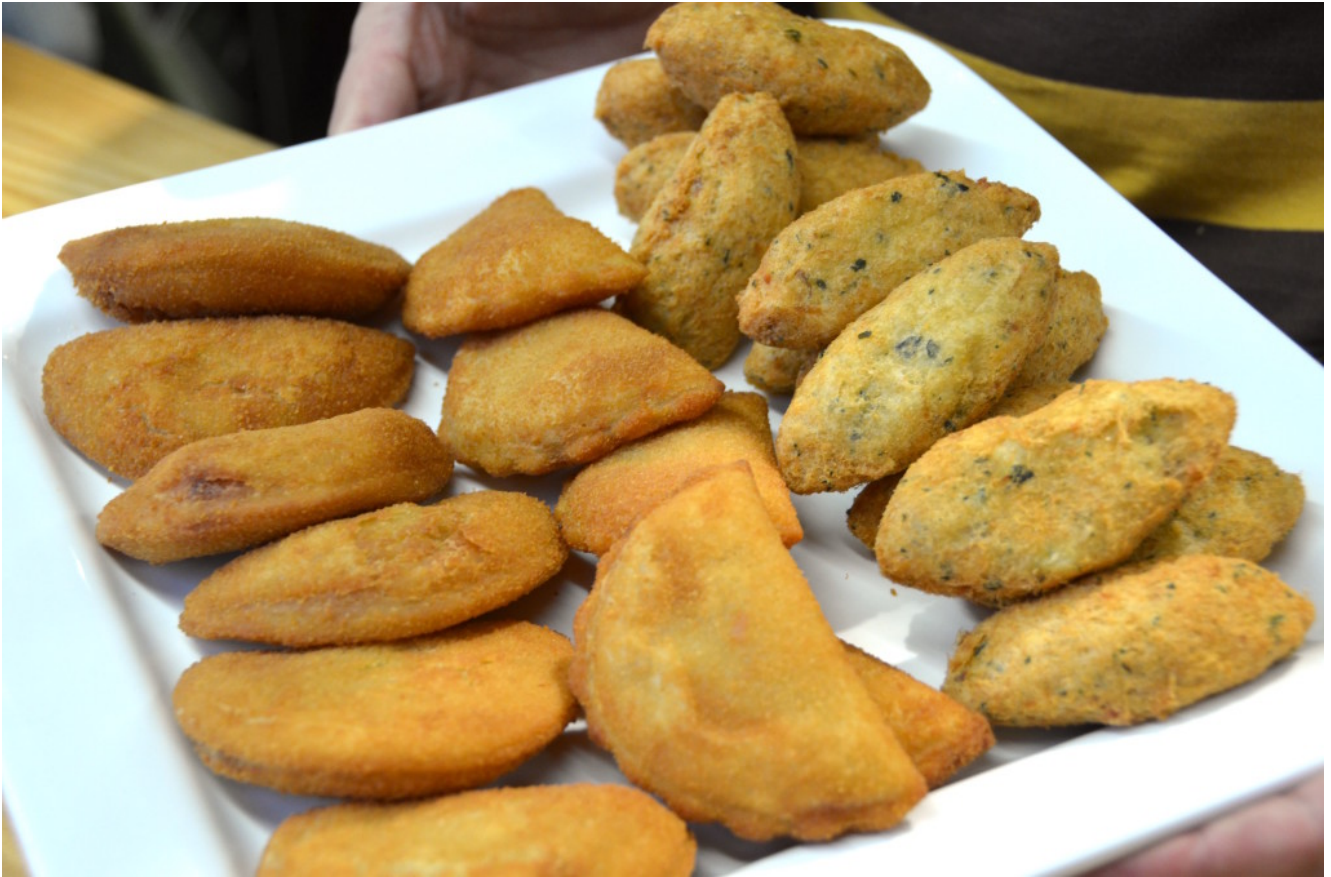
Empanadas and cod croquettes