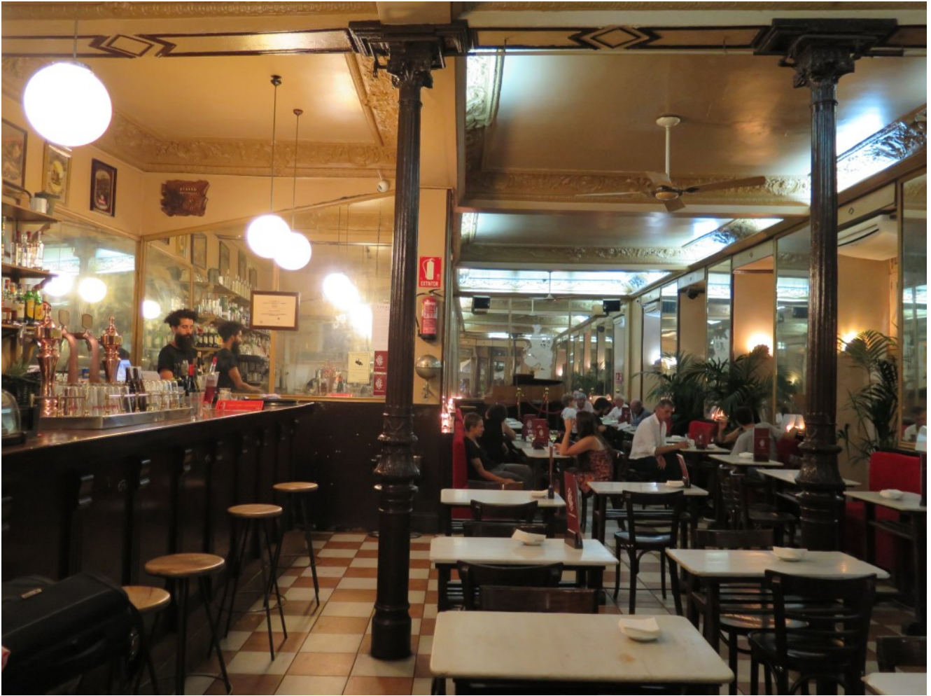
Café Barbieri by night

Café Barbieri is also on the same street as the Greek foodie place, Egeo , so there you have it, your night is planned!