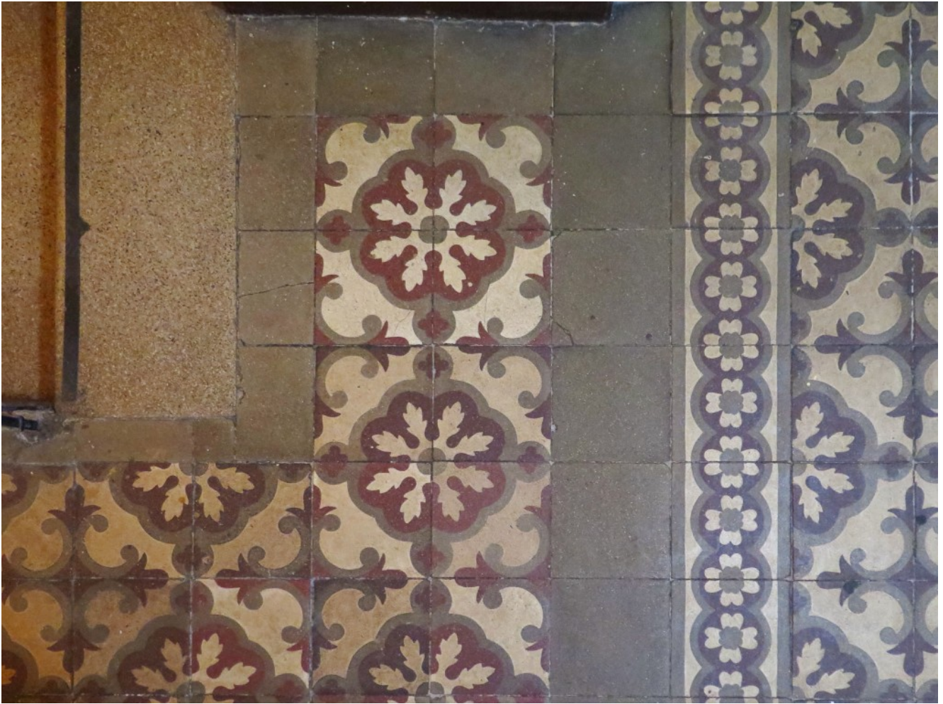
Look at that original tiled floor!