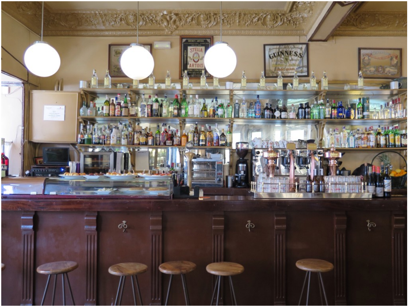
The bar has a great selection of spirits & vermouth on tap