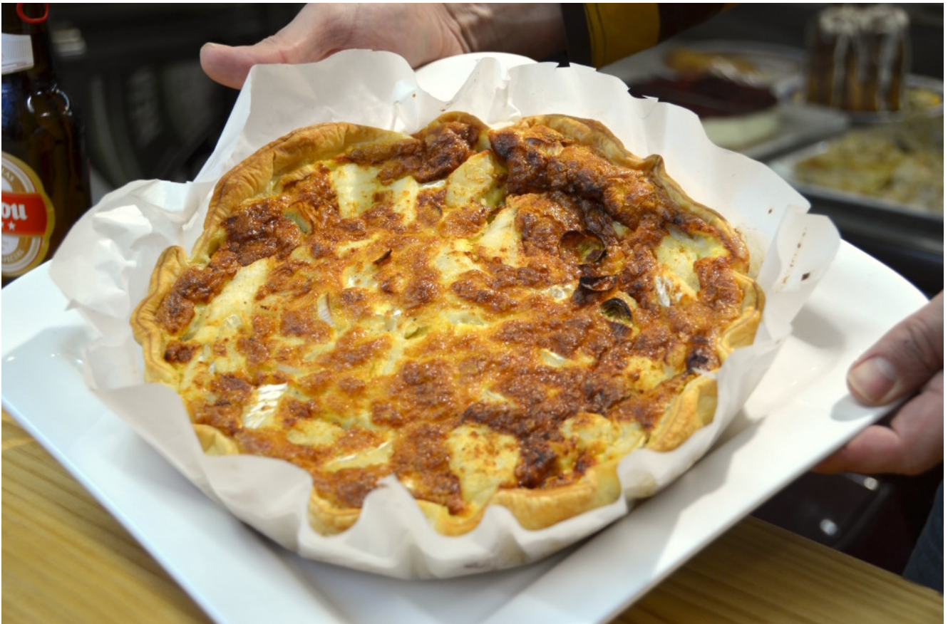
There are lots of quiches here