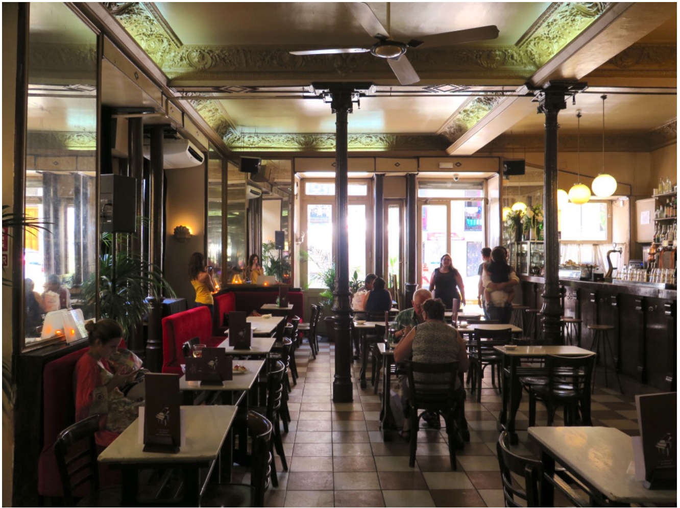
Café Barbieri by day