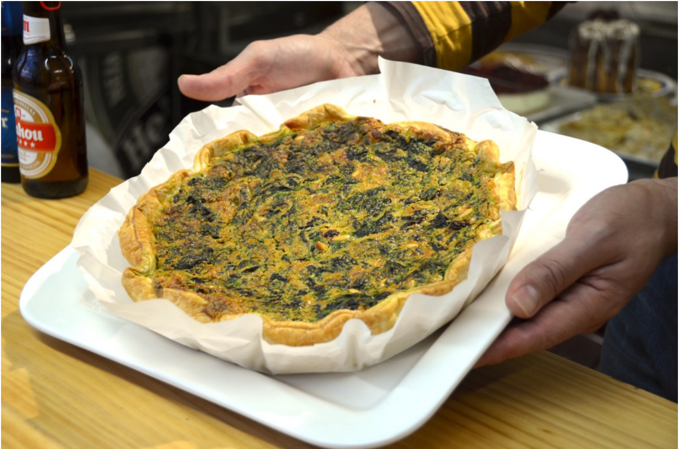
Vegetarian spinach quiche