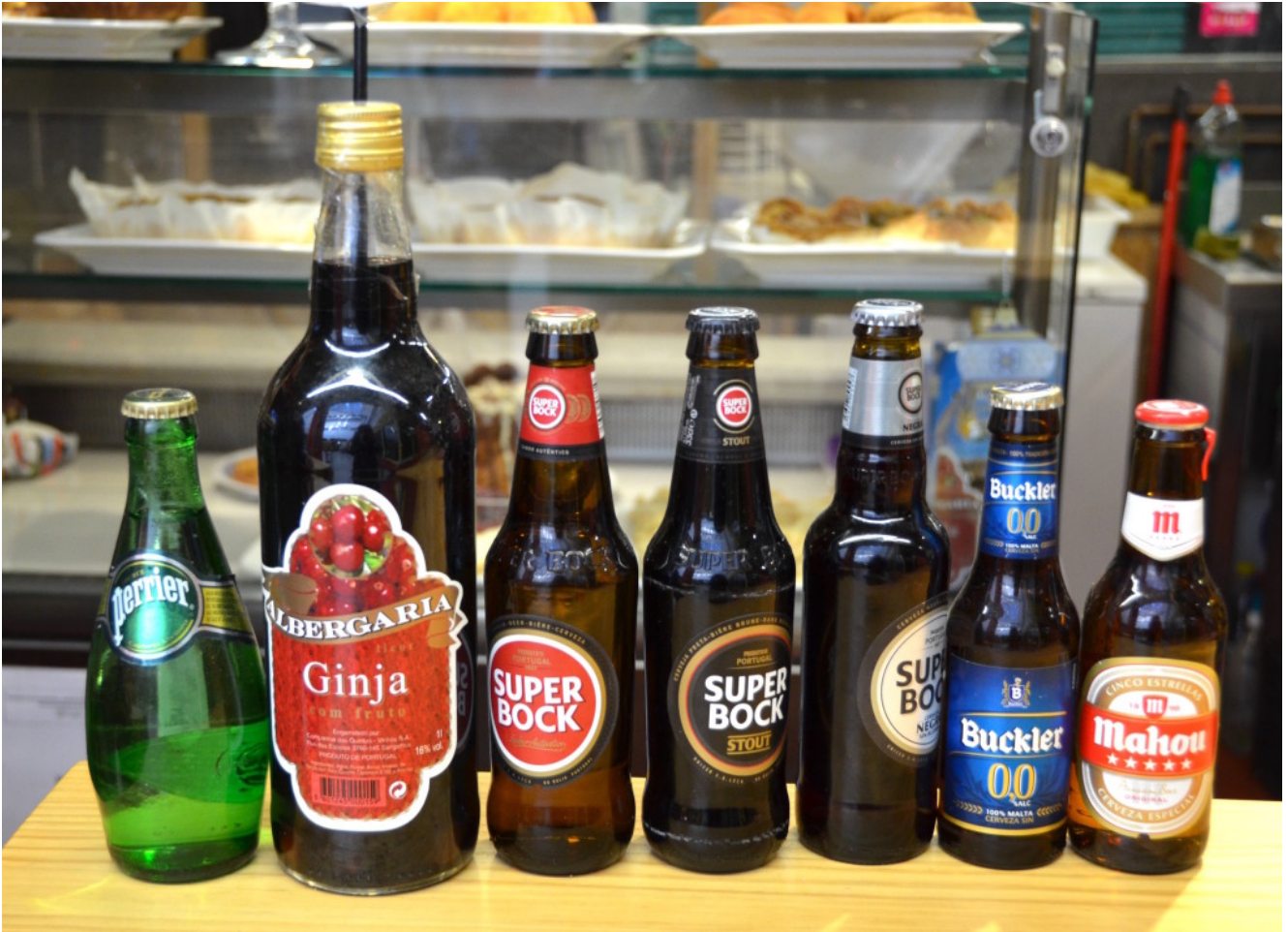
A selection of Portuguese beers

Pull up a chair at Mercadillo Lisboa or mingle in its sphere of influence with a vinho verde and a bocadillo de bacalao . And just so you know, you'll probably bump into me.