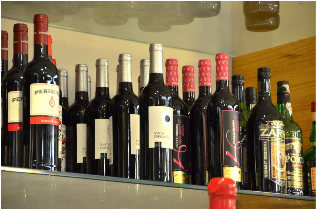
Lots of Portuguese wines and liqueurs