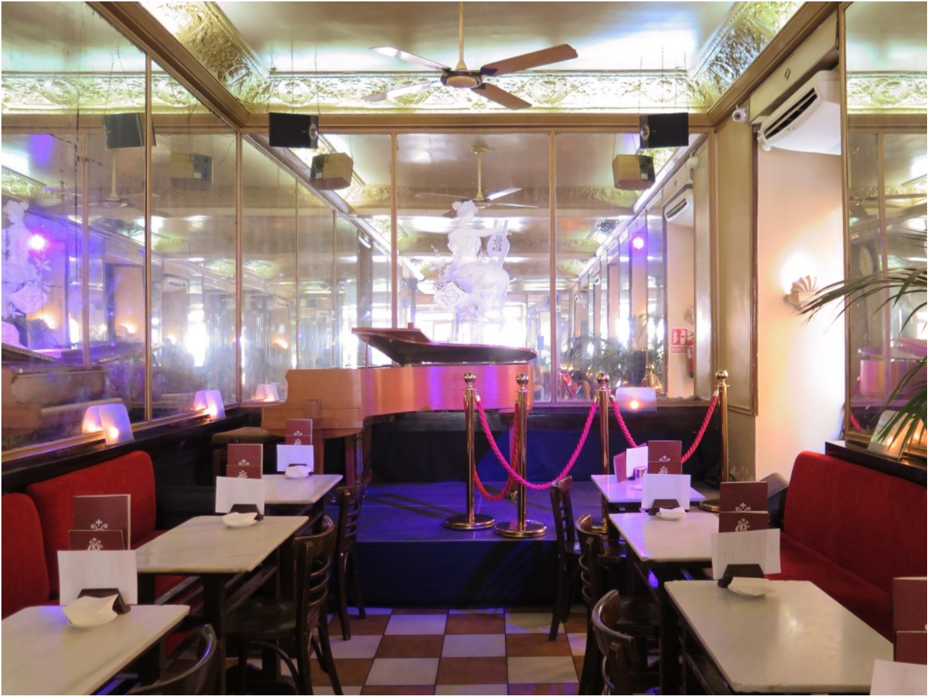
The grand piano taking centre stage, and look at all those beautiful mirrors