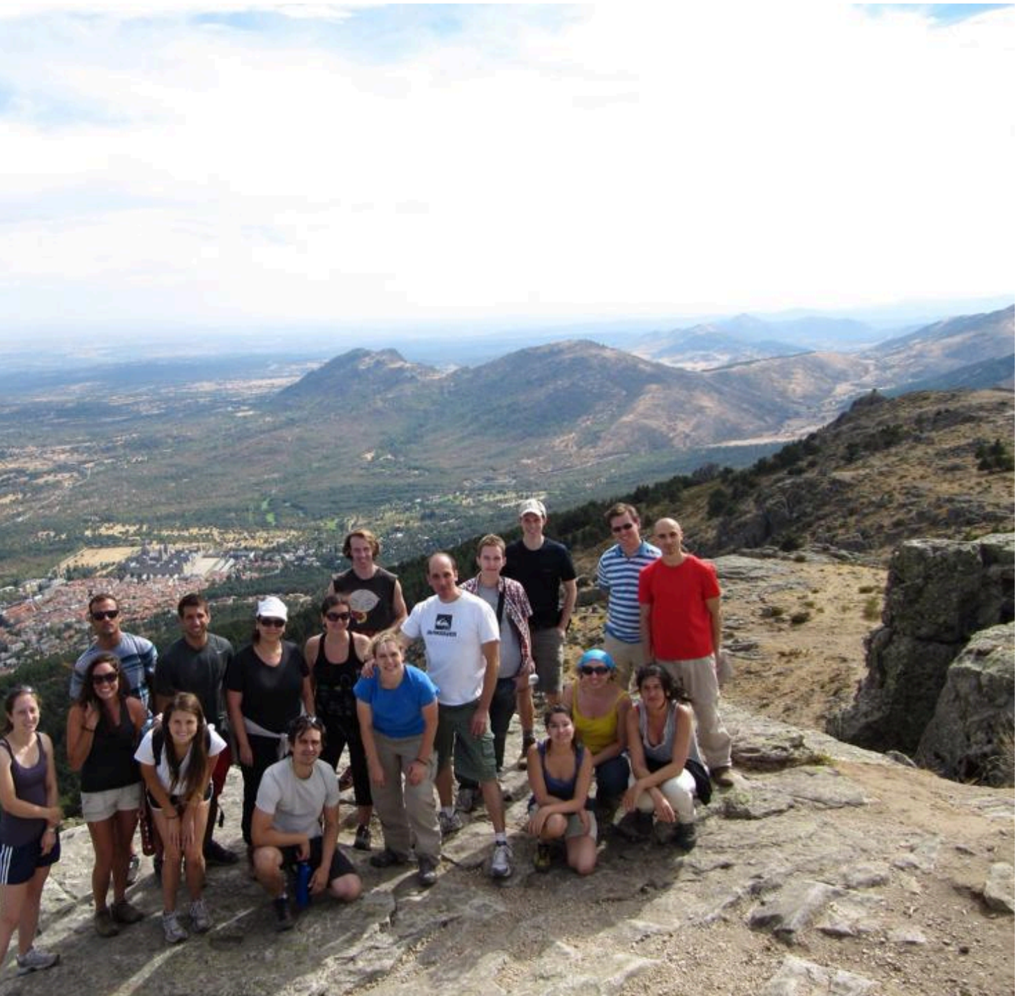
Organised by Hiking Madrid.

Check it out: Website Hiking Madrid or email hikingmadrid@hikingmadrid.com and you can sign up for regular newsletters. Follow on Facebook for regular updates and upcoming events: Facebook Hiking Madrid