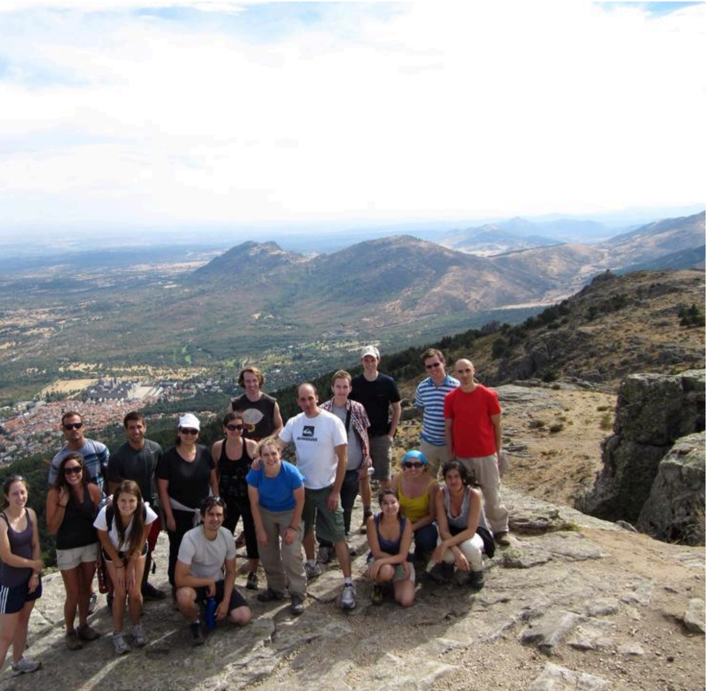
Organised by Hiking Madrid.

Check it out: Website Hiking Madrid or email hikingmadrid@hikingmadrid.com and you can sign up for regular newsletters. Follow on Facebook for regular updates and upcoming events: Facebook Hiking Madrid