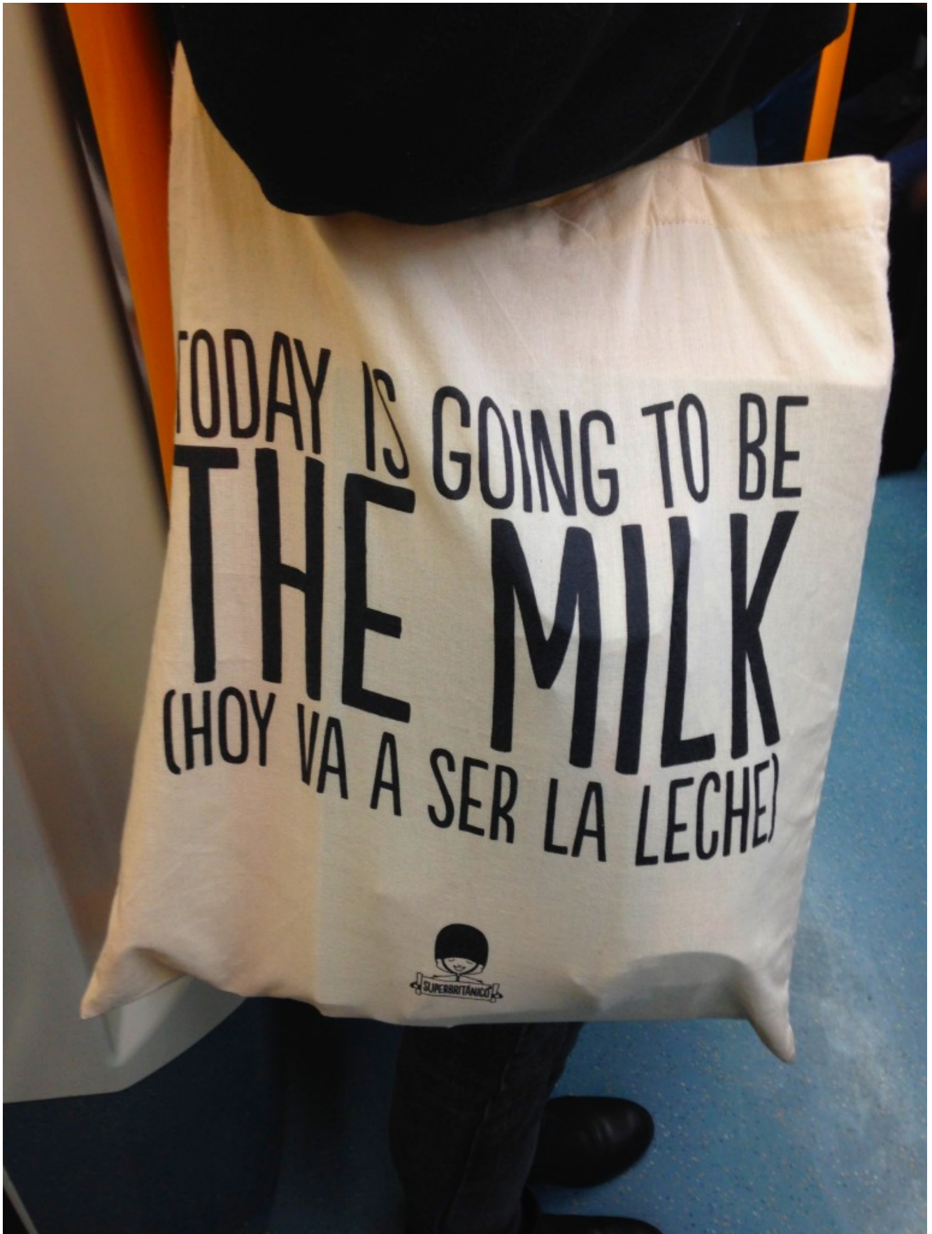
Bags have this stuff printed on them.