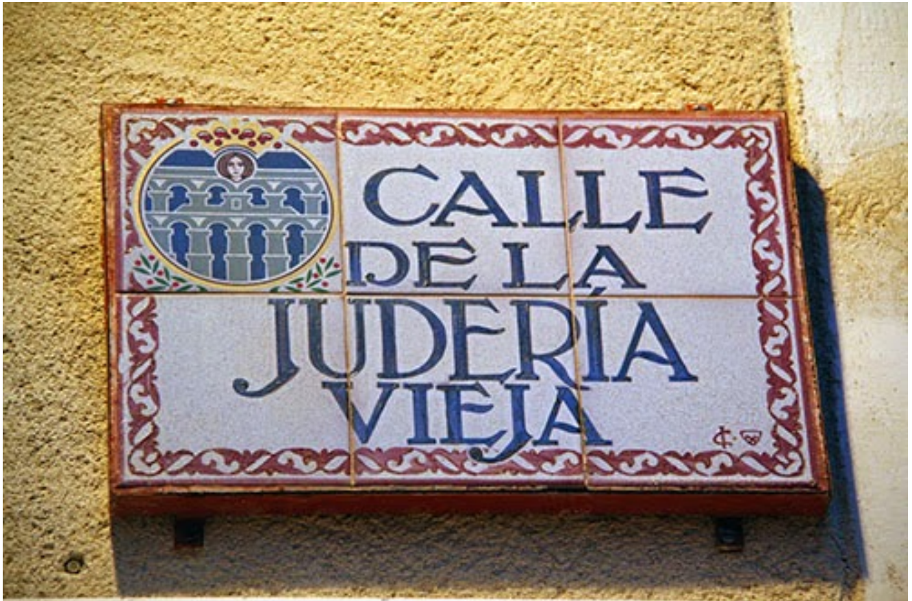
A street sign in Segovia's old Jewish Quarter

During my time abroad I've investigated Madrid's tightly knit Jewish population . I received my first window into their world when I was invited to celebrate Rosh Hashanah with a lovely Sephardic family in their Arturo Soria residence. From them I learned that there are 3,000 Jews living in Madrid, 3,000 in Barcelona, and 12,000 scattered all over the rest of the country —concentrated in locations such as Toledo, Cordoba, and Ceuta y Melilla.