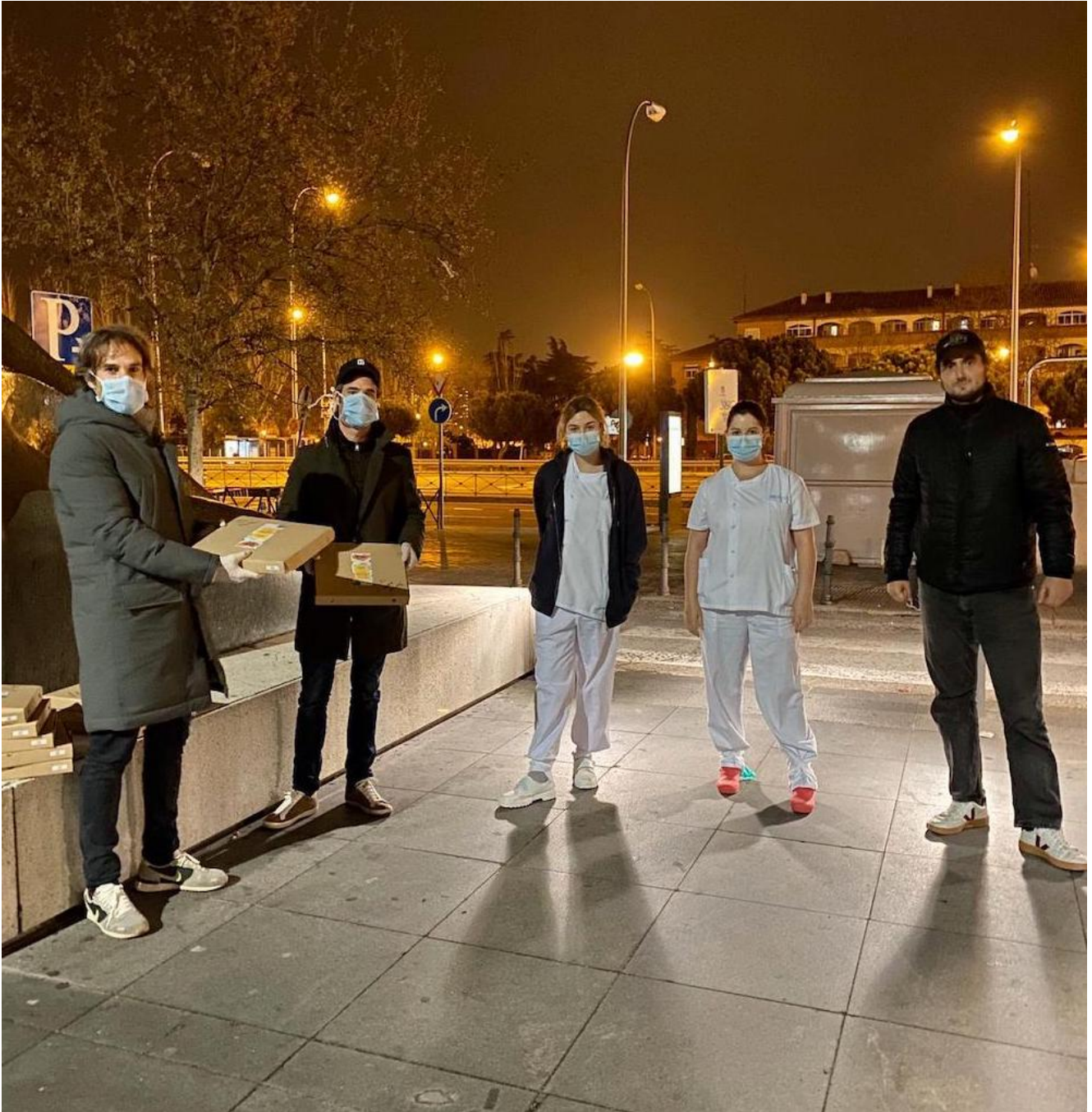
Managers of Grupo Larrumba restaurant group, one of the participants in #Food4Heroes

restaurant group Grosso Napoletano sent a WhatsApp message to all their contacts so they could deliver pizzas to Madrid's hospitals. It went viral – hundreds of messages from medical professionals came in from dozens of different hospitals – which motivated even more partners to volunteer and join forces to show their support.