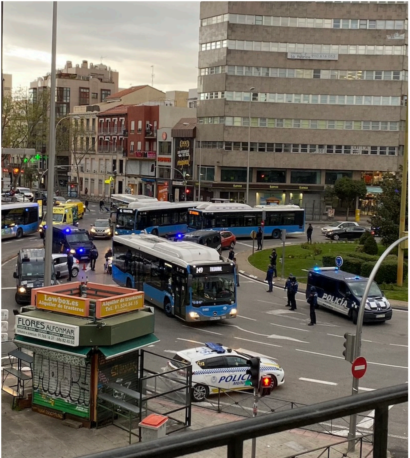
Police checkpoint outside my apartment

Then the lockdown happened. My once solo working environment is now shared with my boyfriend, who is also working from home. He works in sales and is constantly on the phone. All. Day. My once calm and quiet sanctuary has been invaded by ringing cellphones and noisy conference calls. It's been extra hard to concentrate, but we're working together to find