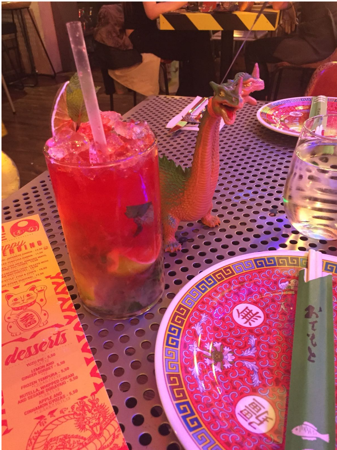
Our aperitivo came complete with a flaming dragon (I was told that I needed to squeeze his tummy three times for good luck)