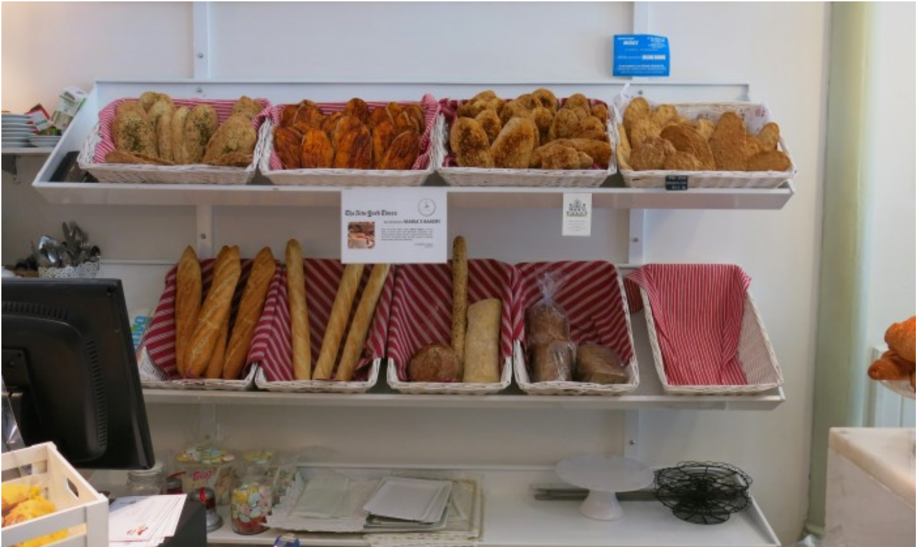
Maria's Bakery in Zurbano

de Bailey's," "tarta de queso con salsa de mora," even the oft-elusive "red velvet."