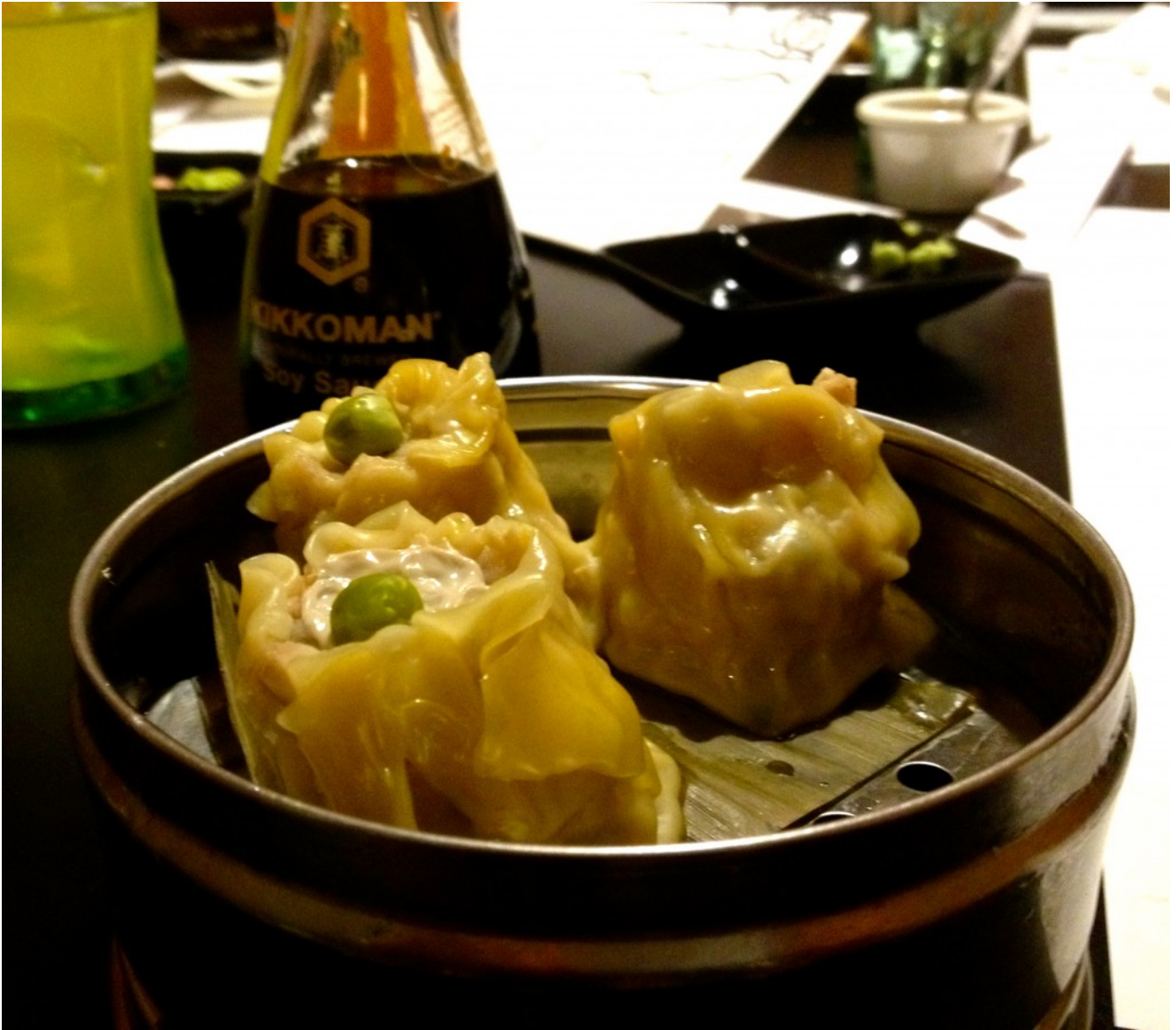
Steamed dumplings... a must