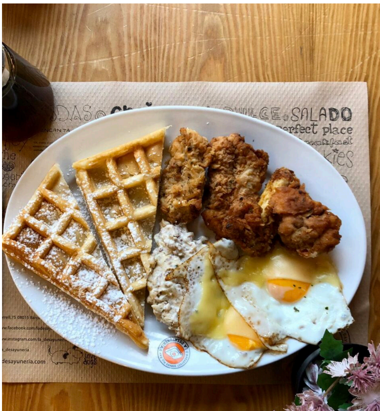
Chicken & waffles with fried eggs

The menu at La Desayunería leaves nothing to be desired: from specialty pancakes, to full American breakfast platters, French toast, bagels, chicken & waffles, omelettes... and that's just the breakfast menu. Go for lunch if you have a hankerin' for sirloin, salads, chicken parm, juicy burgers, fried chicken, buffalo wings, mac n' cheese, and pretty much any other classic American grub you can think of.