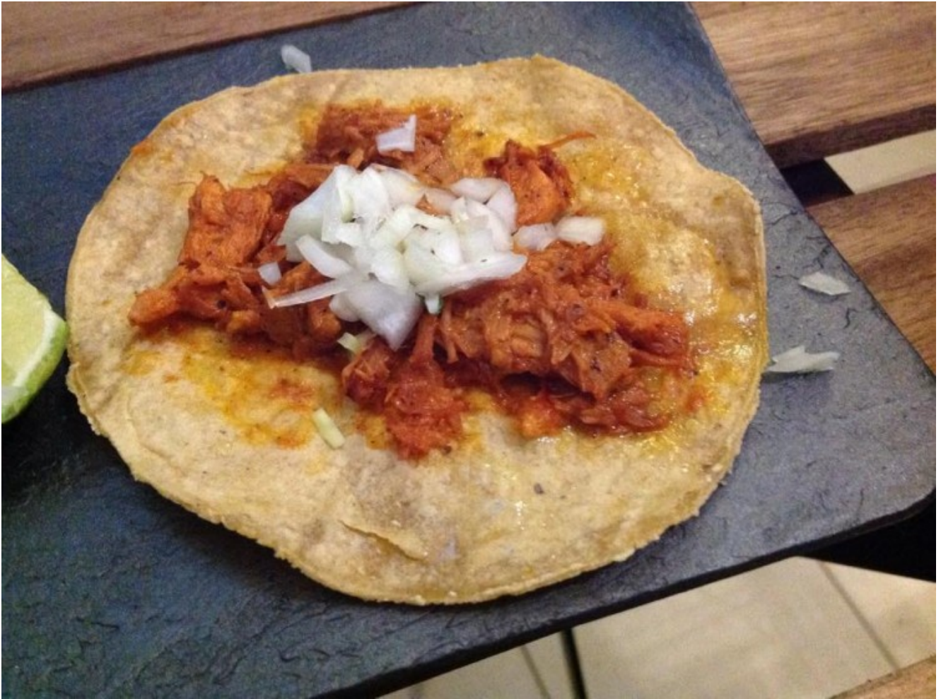
The last taco was Fajitas Alambre de ternera