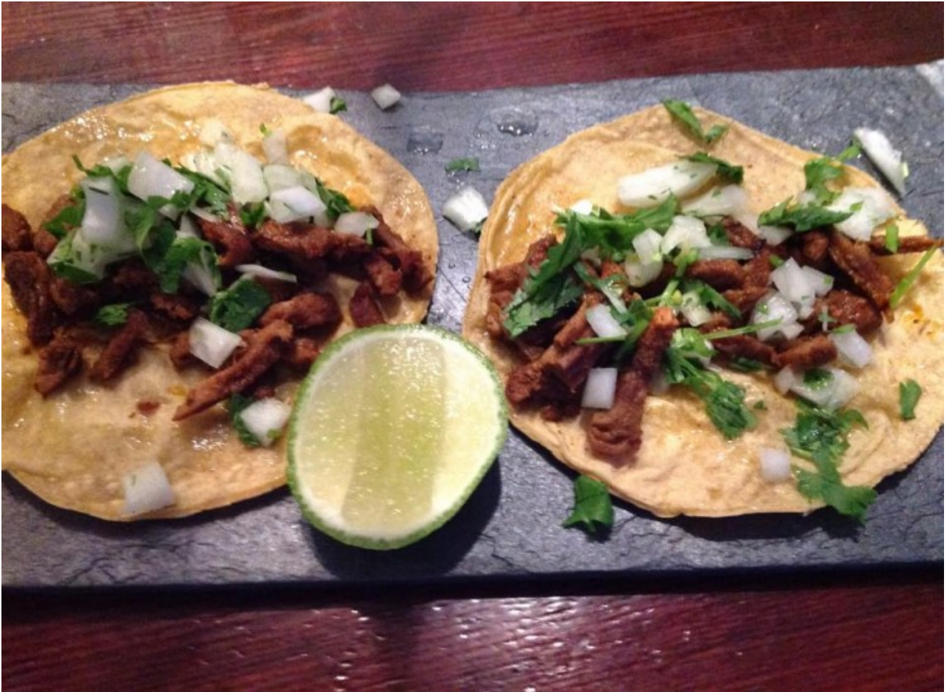
The second specimen was Cochinita de Pibil with achiote.