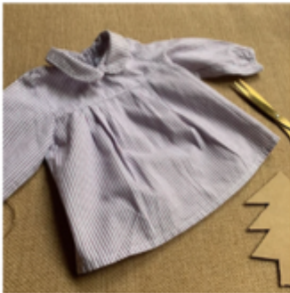
ROPA PARA BEBE 0 - 6 MESES