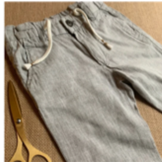
ROPA PARA NIÑOS 1 - 2 AÑOS