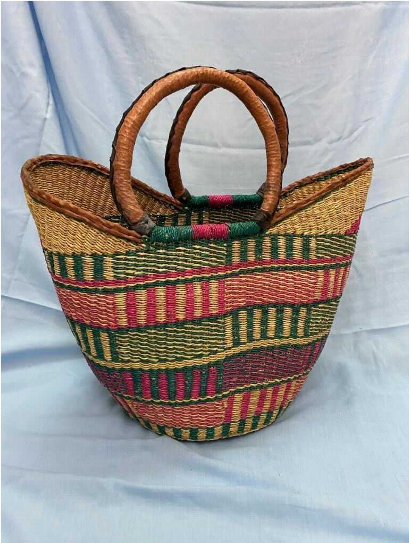
A woven bag from Burkina Faso. (€35)