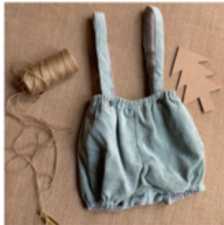
ROPA PARA BEBE 6-12 MESES