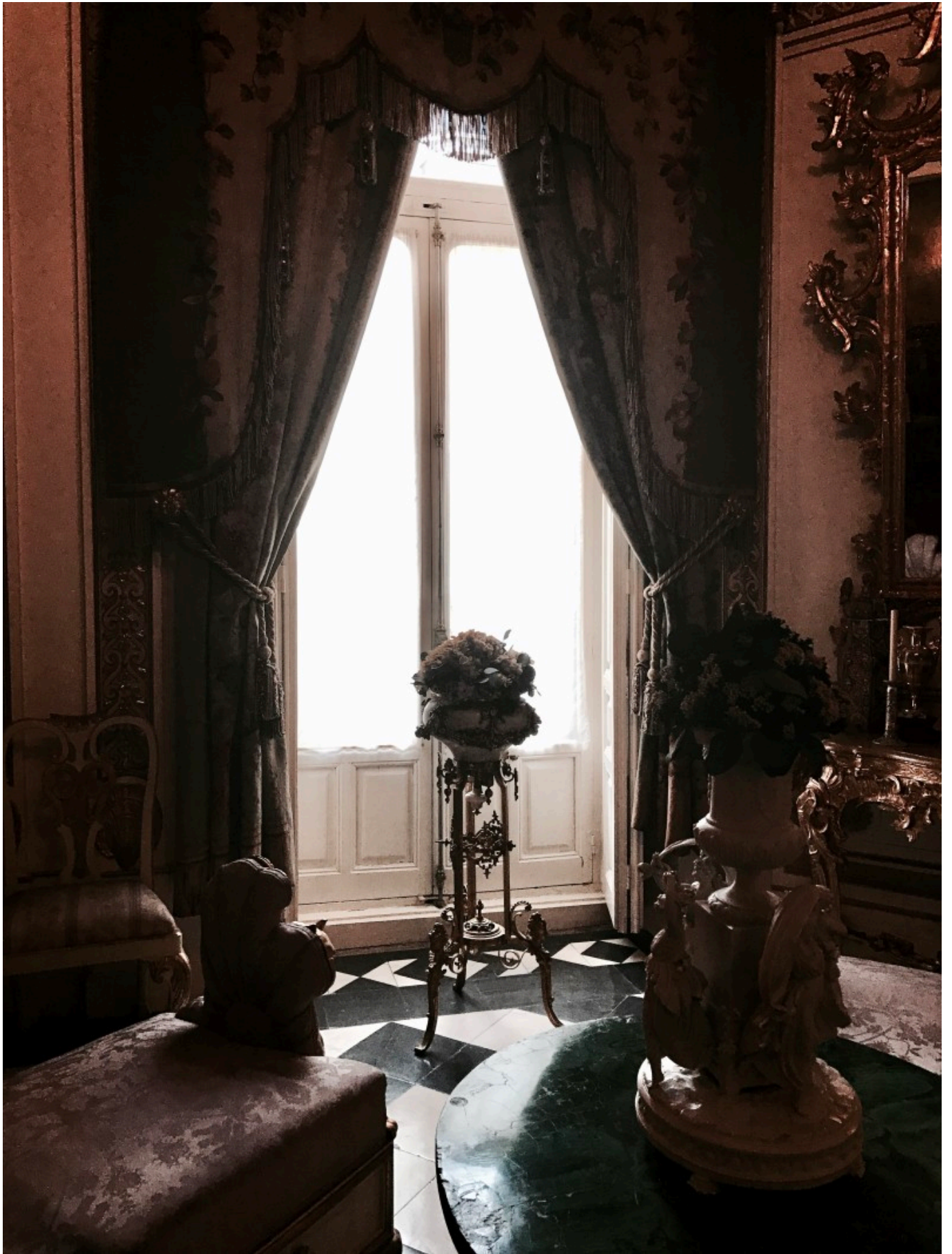
Tucked away on a side street near Plaza de España and Templo de Debod, this museum is one of the former residences of the