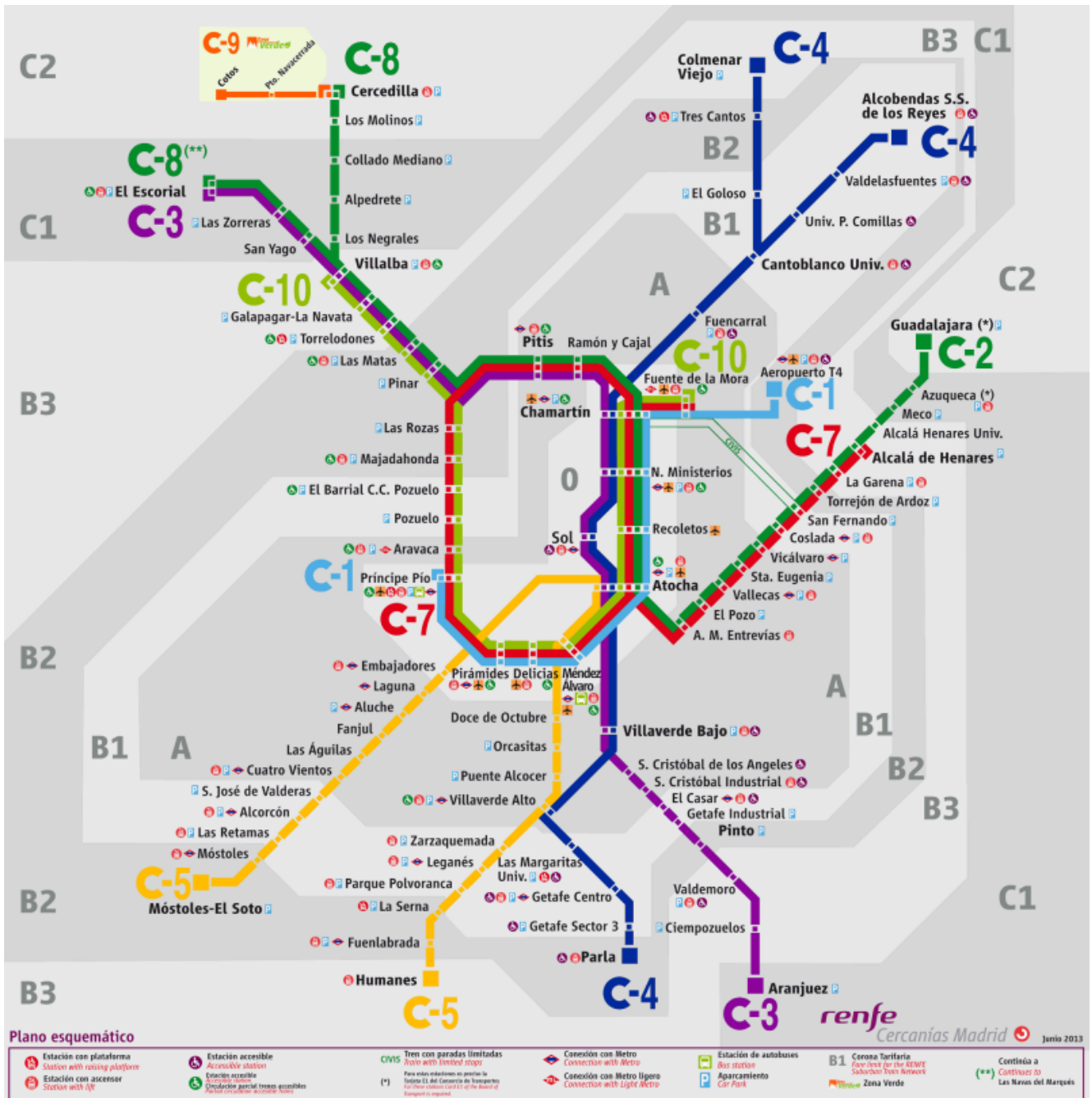
Mapa de Cercanías by Renfe