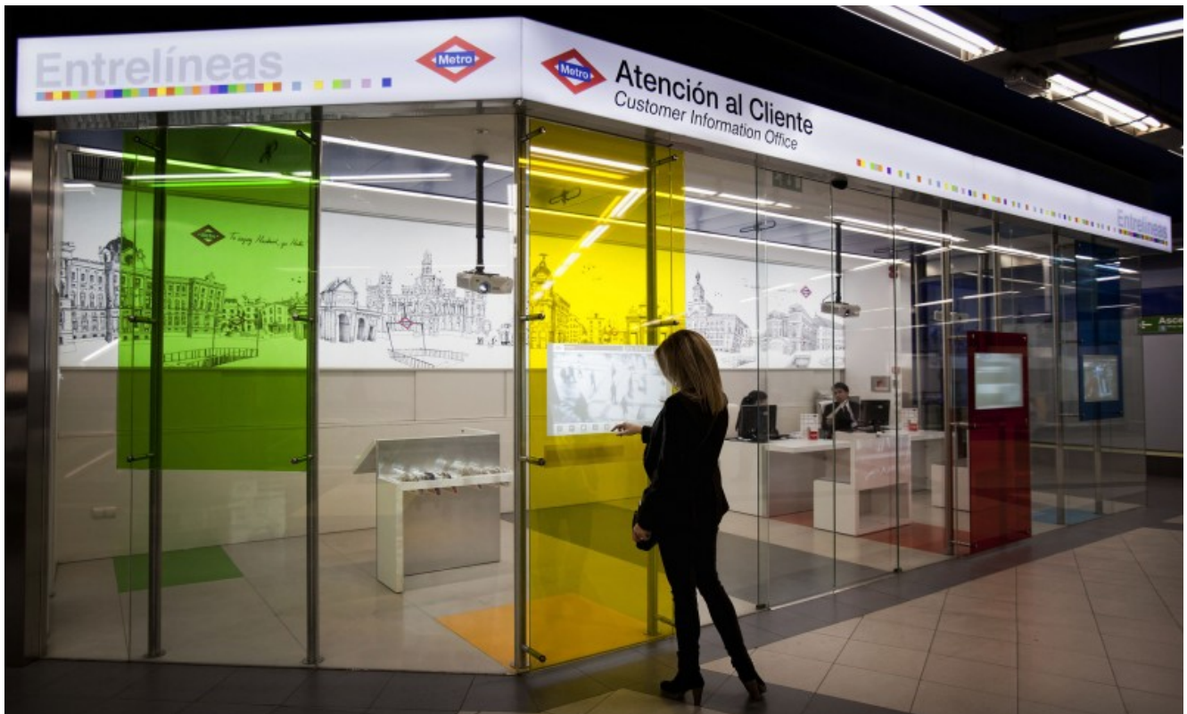
Oficina de atención