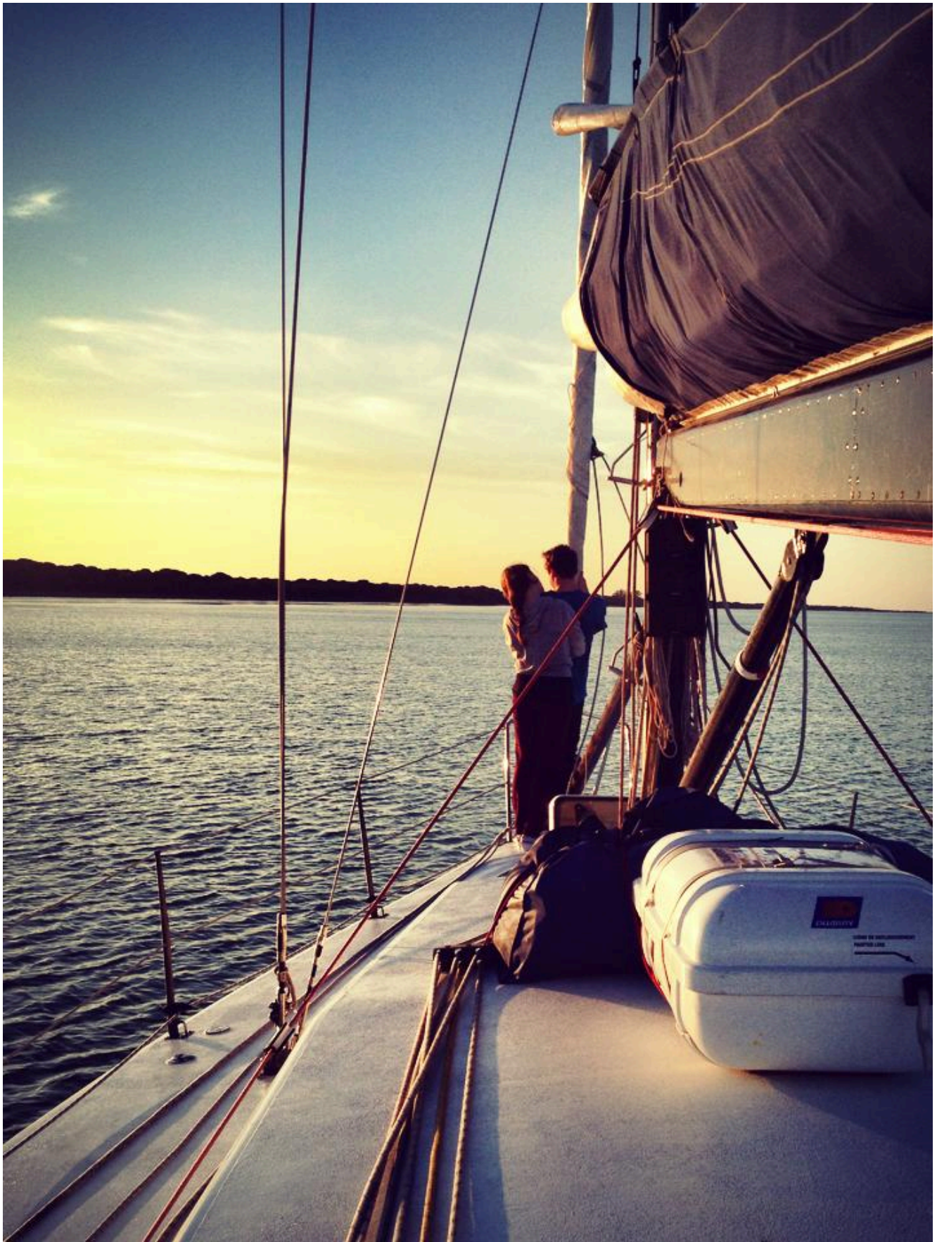
Doñana National Park

The next day, we woke up and had breakfast while the National Park was illuminated by the morning sun. After that, when I